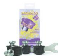
Figure 1 - Positioning of Bushes

4. Refit the arm and test drive the car, remembering to also tension all hardware to manufacturers recommended torque settings.