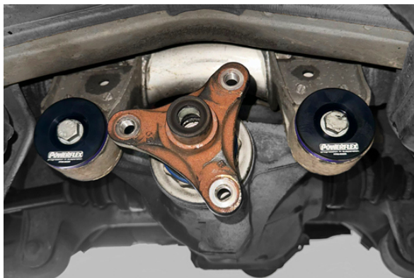
Figure 2 - Fitted